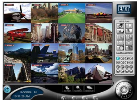
<iDRS-3000A Series GUI>